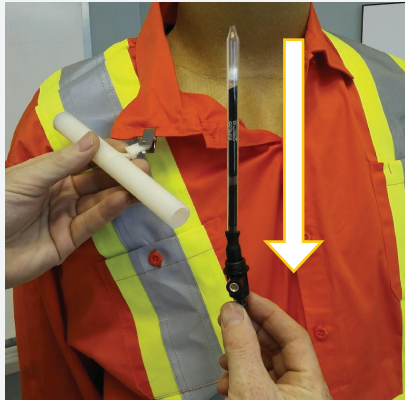
FIGURE 4: Tube attached to black inlet tubing

Tube is oriented according to direction of air flow