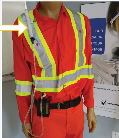
FIGURE 1: General Setup

Carefully snap off tapered ends of glass tube using Tube Breaker