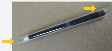
FIGURE 3: Tube ends are broken off, ready for sampling

The general setup for air sampling involving the use of collection tubes as the collection media and personal pumps is illustrated in Figure 1 . Alternatively, if it is not suitable to affix the pump to a worker (e.g. if workers at a facility tend to move around to the extent that they will not capture a representative air sample of a specific work station), you may choose to lay the tube/pump assembly on a table or chair within the area to be monitored. Care should be taken to select a location that is both representative of the air space, away from drafts or ventilation units and off the ground as these locations may bias the collection process.