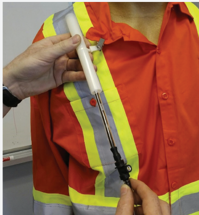
FIGURE 5: Insert tube in plastic protective tube holder and tighten